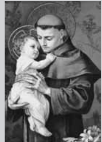
St. Anthony of Padua

Masses: Saturday 5:00 p.m. Sunday 8:30 a.m.